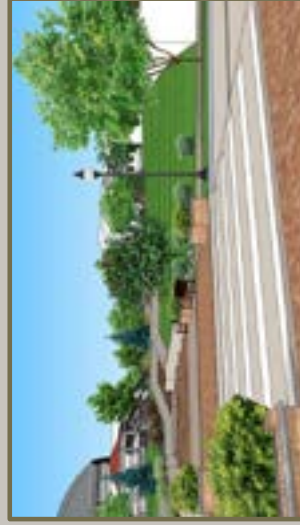
View of the proposed redevelopment of Father Marquette Park in downtown Marquette