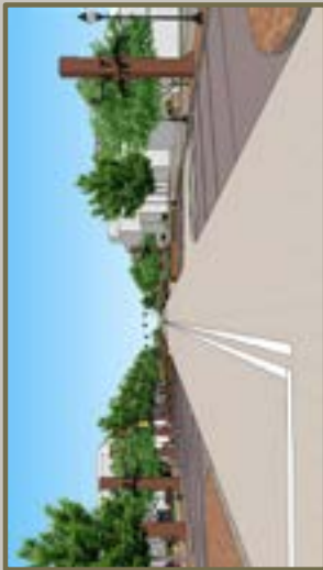
View along Baraga Avenue in downtown Marquette