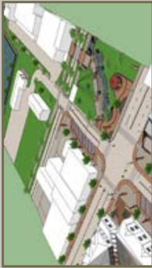
A redeveloped Father Marquette Park in the foreground coupled with a redeveloped waterfront provides potential for public interaction