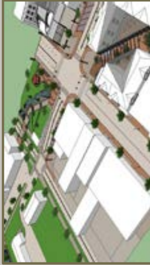
Oblique looking northeast