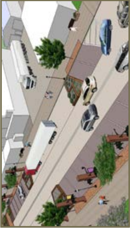
Redeveloping Baraga Avenue will improve traffic flow and increase safety