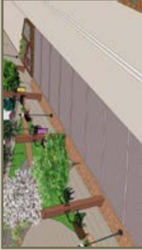
Angled parking along Baraga Avenue