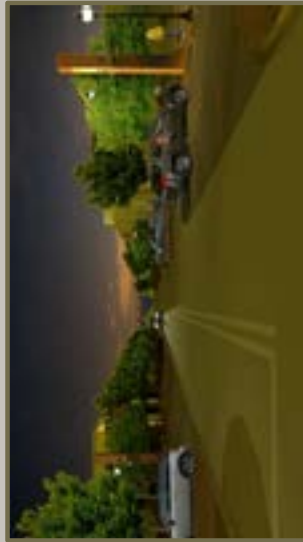
Nighttime view down Baraga Avenue