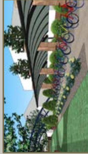
Providing covered bike parking will encourage more non-motorized travel in Marquette