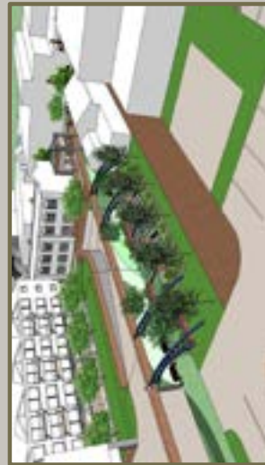
Aerial of the reworked alley off of Baraga Avenue