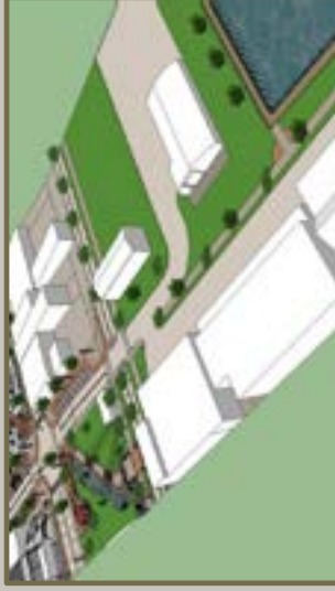
The waterfront of downtown Marquette has a lot of potential for redevelopment