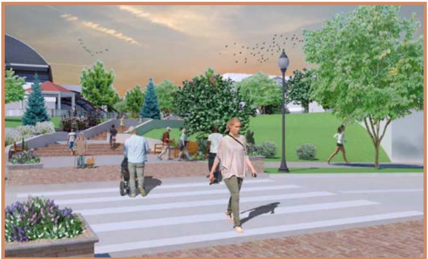
Improving Father Marquette Park will increase public interaction in downtown Marquette by providing a comfortable public space to relax, exercise, and socialize.

connects Marquette with Higashiomi, Japan and Kajaani, Finland and promotes travel and interaction between the three cities. The population of Marquette is 91% white and 4.4% African American.