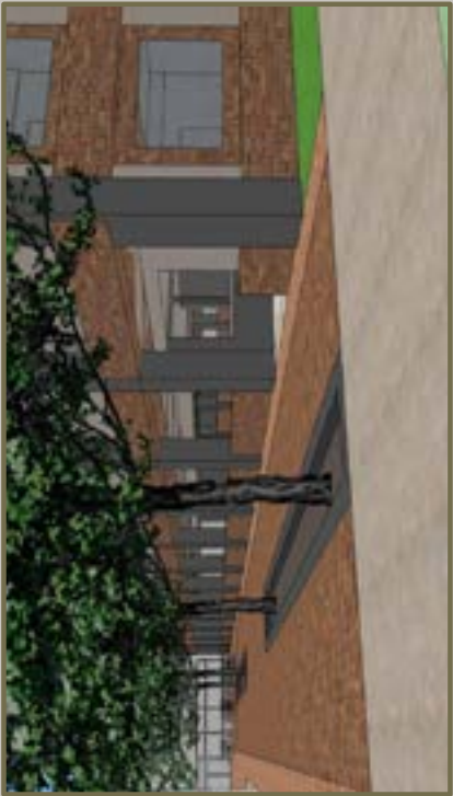
Beautifying the space outside of the proposed parking deck shows that even parking can be beautiful