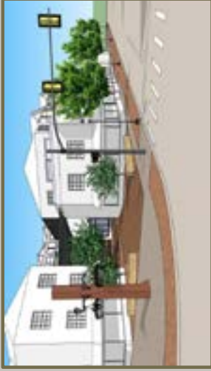
Placing a traffic light at Baraga Avenue and Front Street will improve safety for both motorists and pedestrians