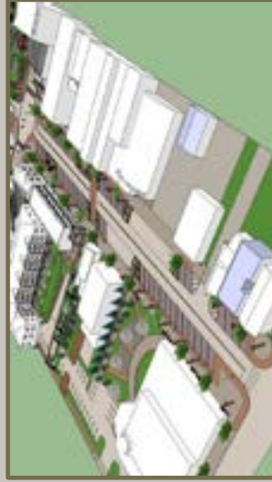
Redesigned parking will give Baraga Avenue new life