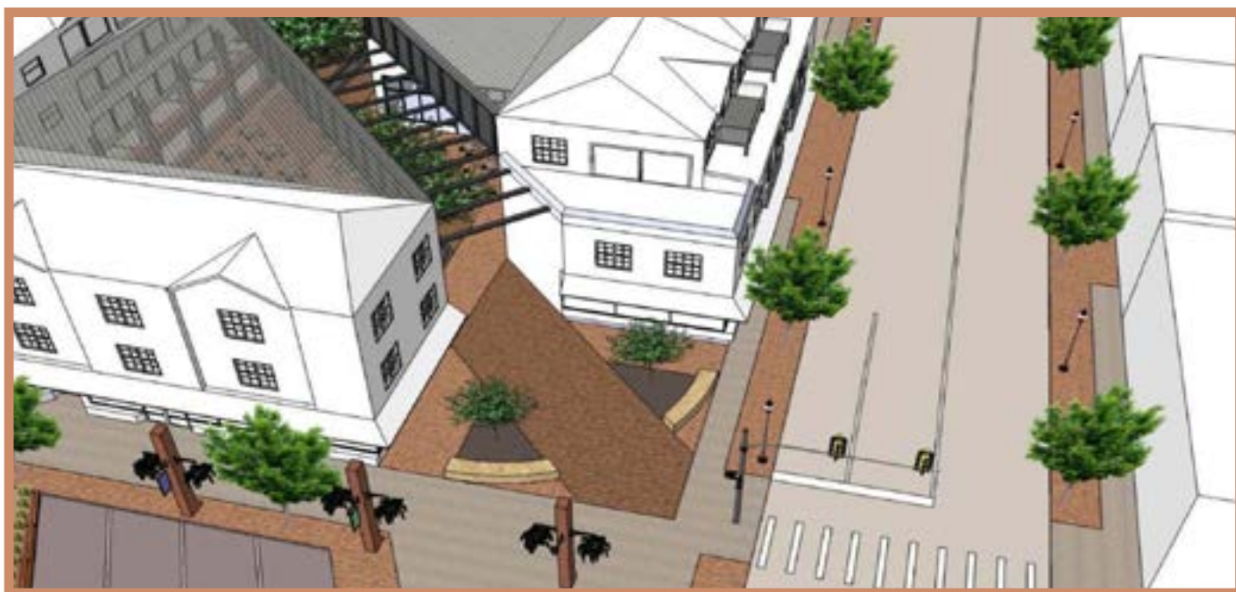
The proposed mixed-use building at the northwest corner of Baraga Avenue and Front Street

new businesses and expansion of existing businesses along its path will be key to defining it as a 'place' in and of itself, rather than merely a new way to get from point A to point B. While existing and new traditional small businesses operating out of storefronts will activate the street and the area surrounding it as a vibrant public space, allowing ease of entry for nontraditional small businesses—such as food carts and street performers—is equally important as these models are community-focused and require little start-up capital. With the capacity to support a mix of uses—including retail, office and professional services—non-retail businesses should be encouraged to locate along the corridor. The daily presence of workers will further activate the street at regular times and provide year-round support to retail and restaurant functions.