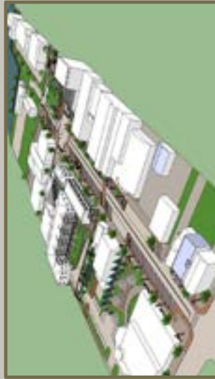
Oblique looking East