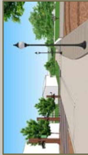
Simple children playscapes have historical background