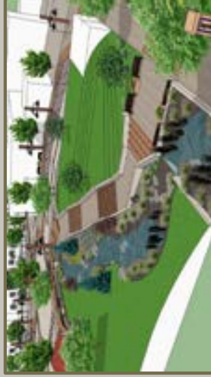
The stormwater management system in the improved Father Marquette Park