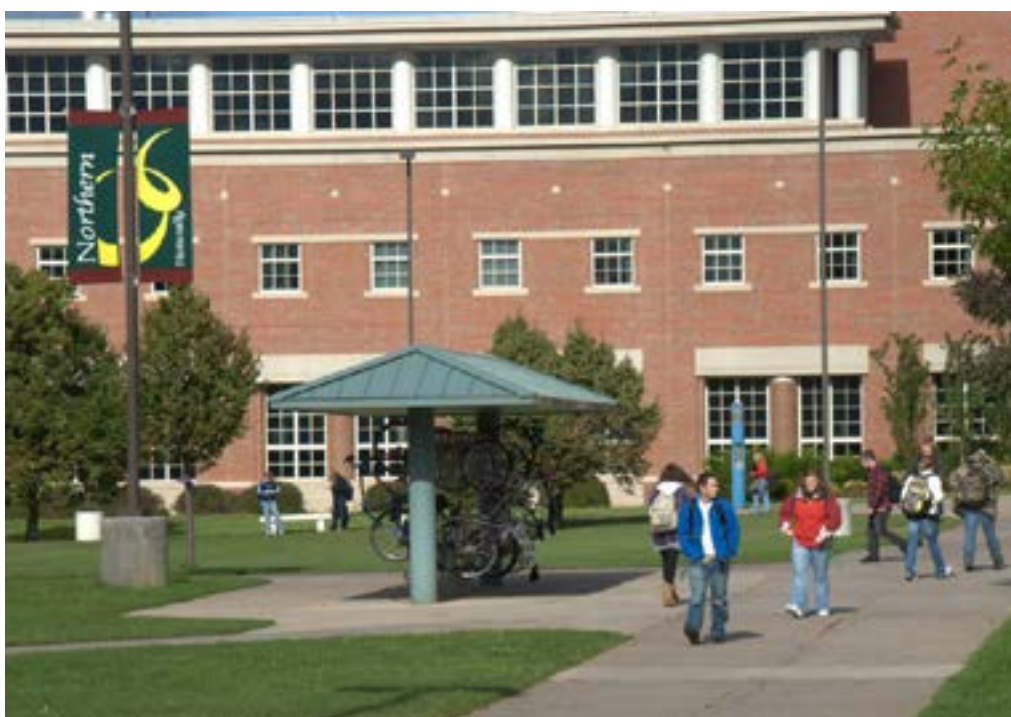
Students walk the campus of Northern Michigan University in Marquette.

and Master's programs. The university hosts an Olympic training site focusing on wrestling and weightlifting. NMU is located in the northern portion of the city, though the Third Street corridor makes a direct connection to down-