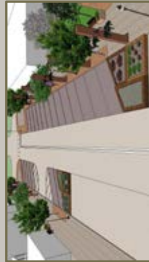
Turning the existing on-street parking into angled parking will improve safety for all