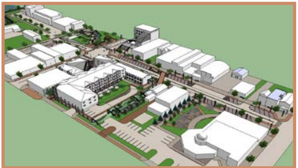
Aerial View of Proposed Project

can be removed, opening access to snow removal crews that can work uninhibited by obstacles in the vehicular domain. This allows for more efficient and environmentally sensitive design that will free up parking and sidewalk space, decrease unsightly snow piles that block store frontages, and decrease slushy run-off to Lake Superior. While parking issues led much of the conversation, many of