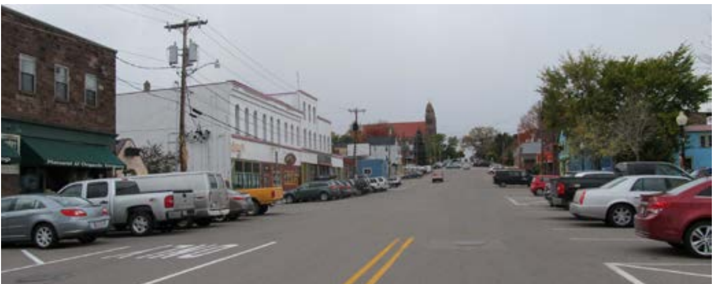
Baraga Avenue Today

Community agencies and organizations, as well as the private sector, recognize that the strategic planning and harmonization of downtown redevelopment activities are critical to the goal of successful placemaking for Downtown Marquette. Working together as a community to revitalize this area of Downtown Marquette will help to spur economic and social development in the city as a whole.