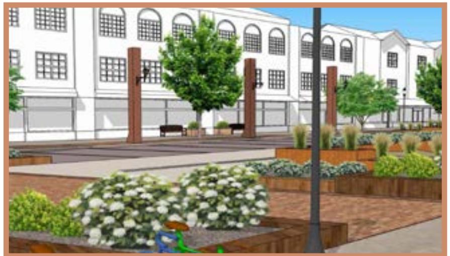
Increasing the amount of plantings along Baraga Avenue will beautify the space while also making visitors feel more comfortable

Marquette is dedicated to environmental sustainability and has ongoing projects to balance development with maintaining a quality environment.