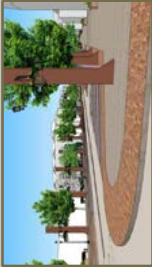
Incorporating historic elements such as “rusted” iron into the streetscape will increase Baraga Avenue’s sense of place