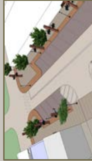
Developing adequate crosswalks will improve pedestrian safety at intersections