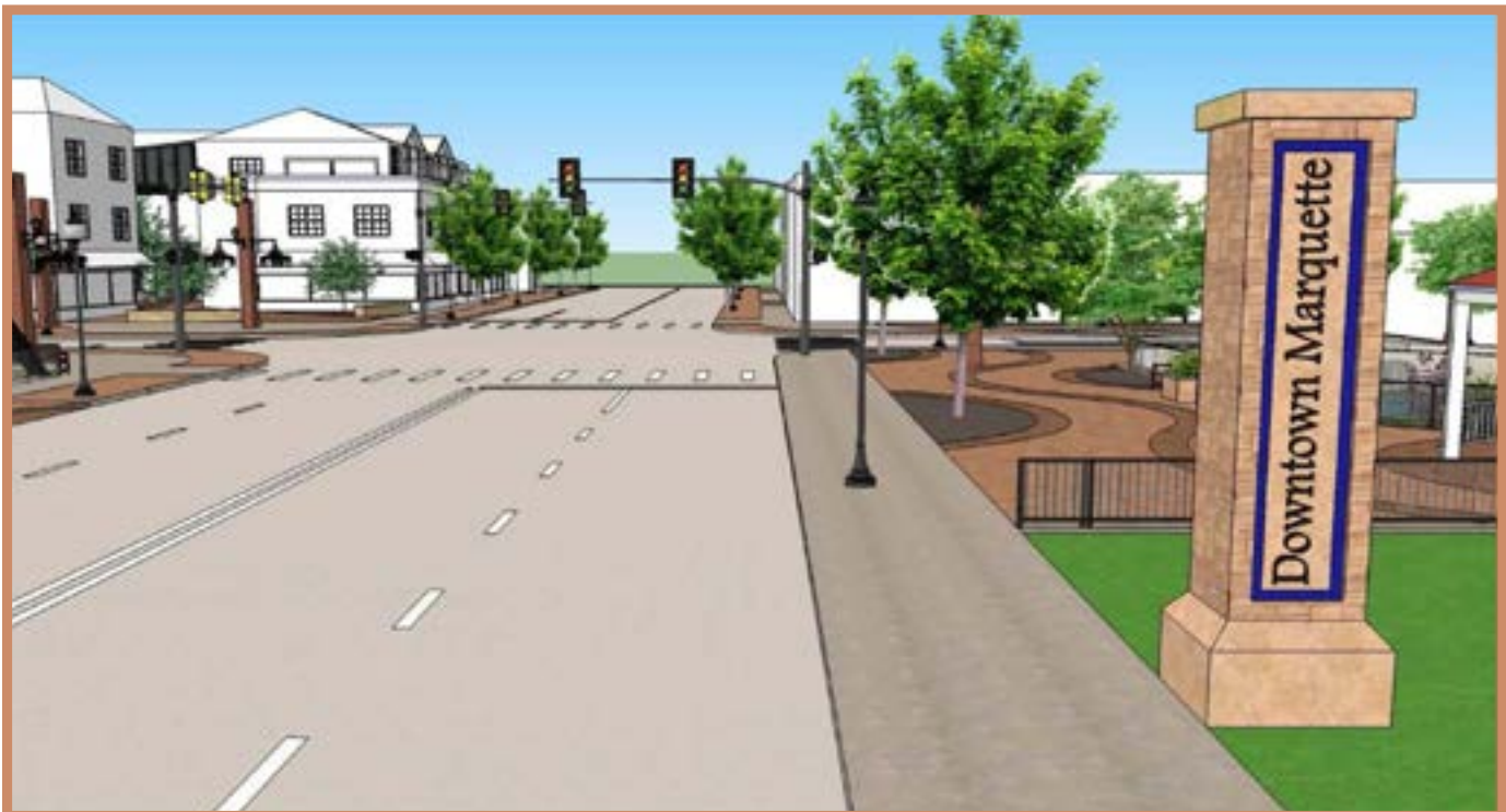
Utilizing Baraga Avenue as the “gateway” to downtown Marquette will improve the area’s sense of place.