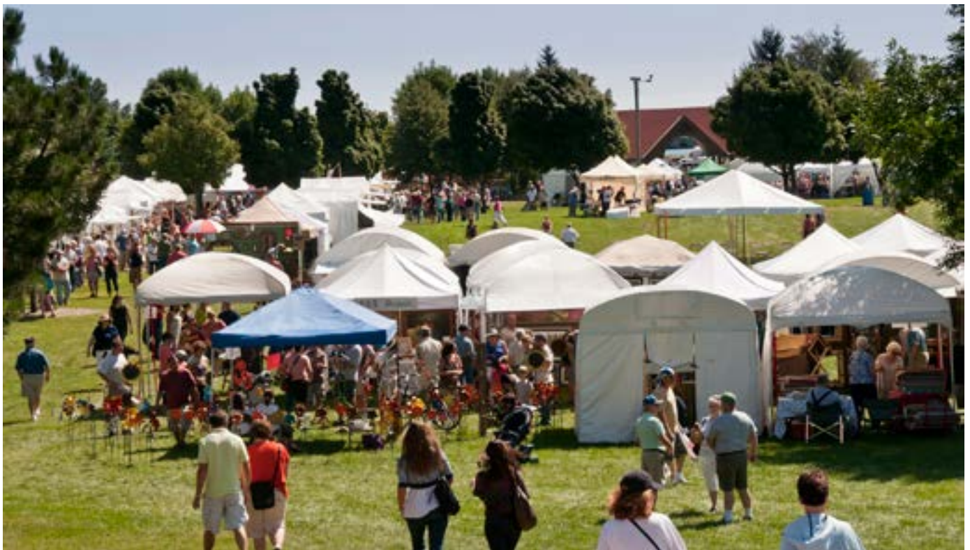
Art on the Rocks art festival in Marquette

The city website has a contemporary design and is easy to navigate, offering a wealth of information and documents. Many area businesses offer free Wi-Fi access. Connect Michigan gives Marquette a score of 100 for Broadband Internet access, with multiple sources of coverage available throughout the city (though many nearby rural areas remain unserved). The local newspaper, The Mining Journal , has an up-to-date and functional website, though most content requires a subscription to view.