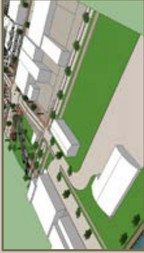
Developing the Marquette waterfront as an open space will provide the city with the necessary space to host festivals, concerts, etc.