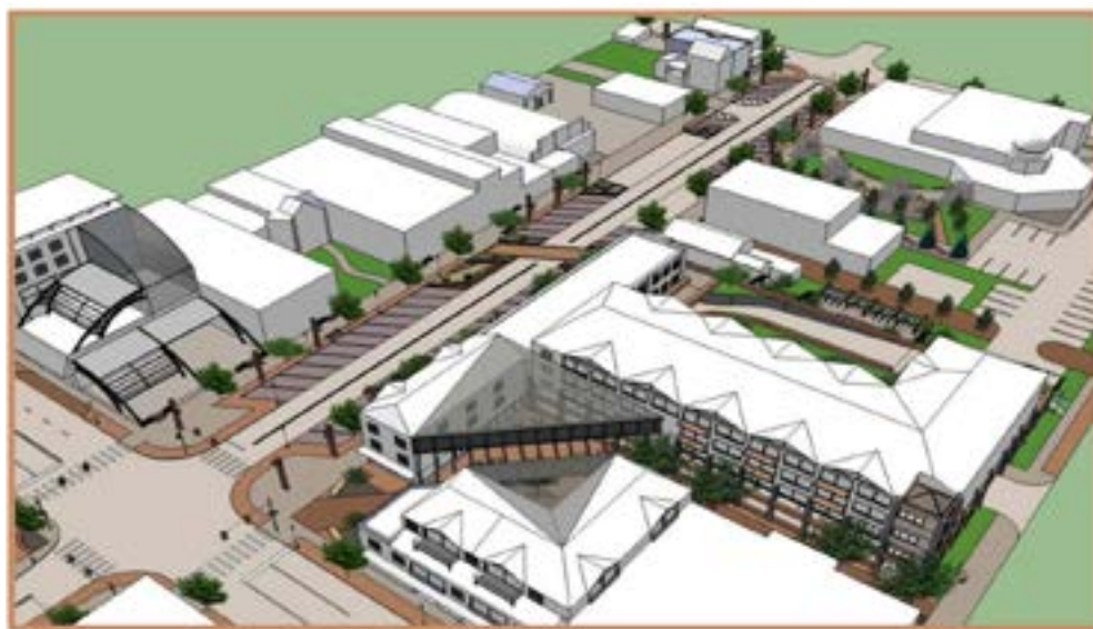
Overview of the improved Baraga Avenue, with the proposed mixed-use building and adjacent parking deck along the north side.

Avenue feature a number of surface parking lots, which discourage pedestrian activity, and buildings that don’t have the same “storefront” character that encourages strolling and window shopping in the downtown. (Consider the Children’s Museum for an example of a building front that invites people to walk past it, even if it is not their destination.)