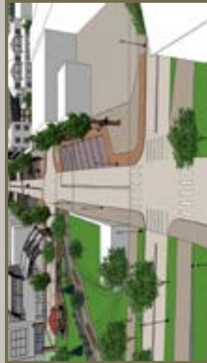
Aerial down Baraga Avenue looking west