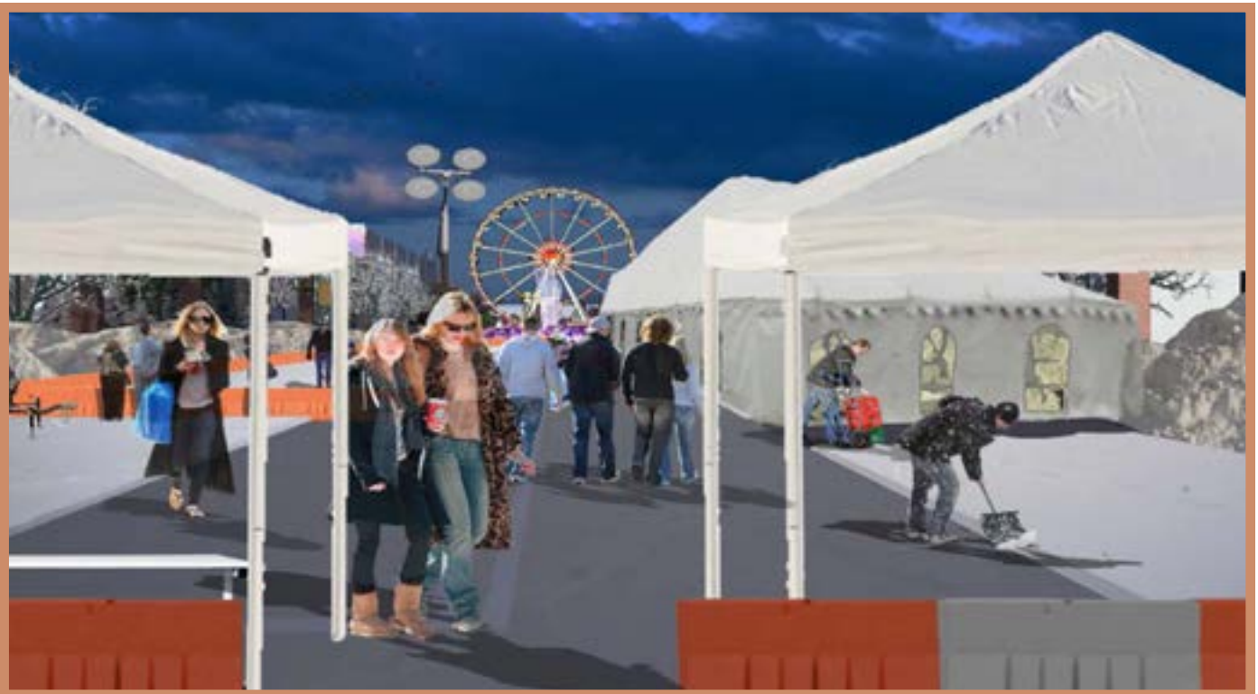
Using Baraga Avenue in all seasons will improve the quality of life for residents of Marquette