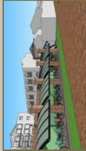
Reworked alley off of Baraga Avenue