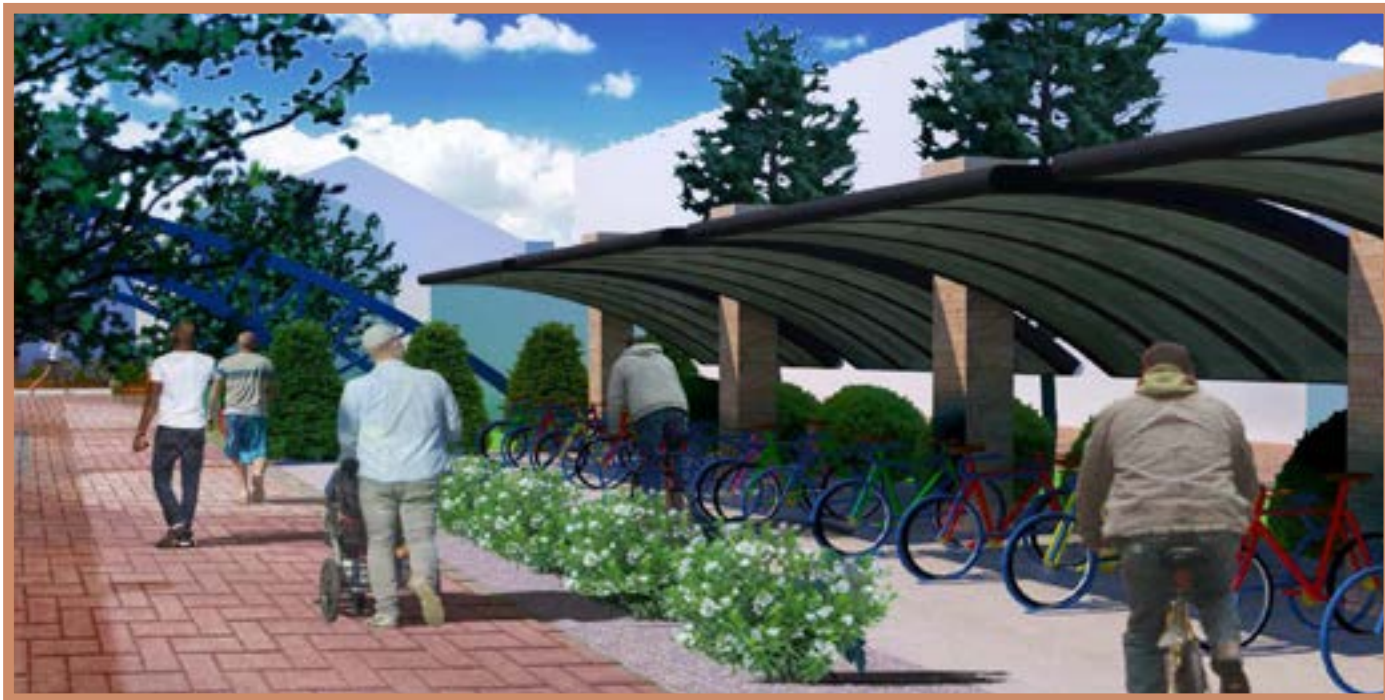
Improving the alley off of Baraga Avenue will encourage more visitation to the downtown

The city completed a mobility management planning process with Smart Growth America in 2013 that covered this topic in depth, with three implementation priorities selected: completion of a human services coordination plan to better link transportation options with needs; a marketing and communications initiative to help residents and visitors understand their options; and the development of a new fixed route running a loop on Third Street, which would connect downtown to Northern Michigan University. This new route is shown in the plan as reaching Spring Street at its southern end—bringing it a block further could help connect Baraga not just to downtown but also to campus.