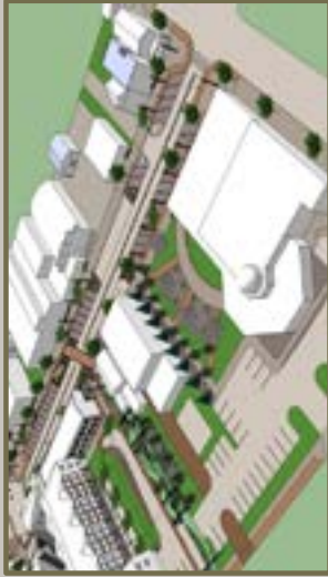
Beautifying the space along Baraga Avenue will make it a more aesthetically pleasing location for social interaction