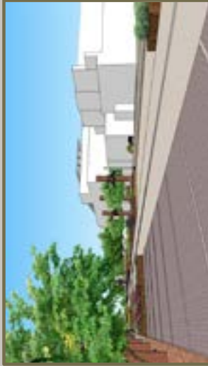
Memorial fountain directly connects with plaza