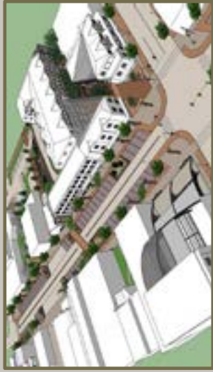
Oblique looking northwest

The following are additional images that were not included in the body of the report and further illustrate the design concepts.