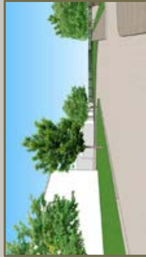
View of an access street along the Marquette waterfront