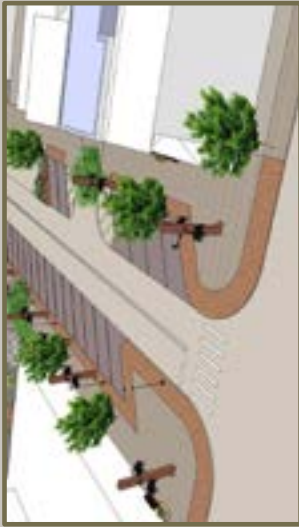
View of angled parking and crosswalk along Baraga Avenue